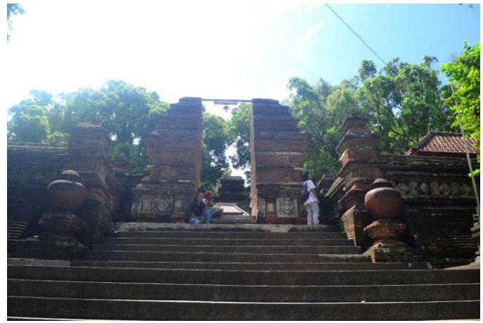
Figure 1 : Gapura Bentar made of red brick that looks magnificent as the gateway to the tomb of Sultan Agung. Examples of the use of Javanese Hindu architecture on Islamic tombs at Imogiri Cemetery Site.

The site of Imogiri Royal Cemetery located in Mount Merak was established by Sultan Agung for his own tomb (see <u>Figure 1</u>). Babad Alit states that the construction of Imogiri's tomb was handed over to Sultan Agung's uncle (<u>Prawirawinarsa & Djajengpranata, 1921</u>). Another manuscript, Babad Momana states that the construction of the tomb, along with several gates built in Javanese Hindu architecture was completed in 1567 year of Dal, Javanese year or 1632 AD (<u>Anonim, n.d.</u>, p. 18).