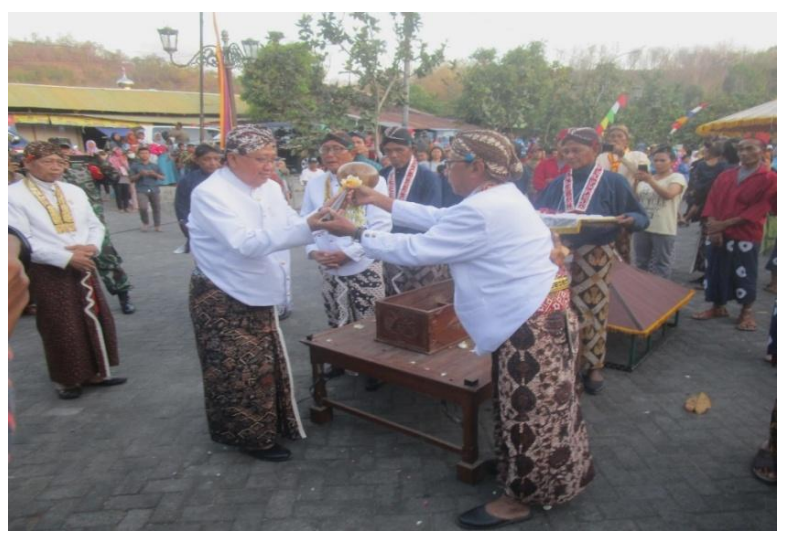
Figure 4 : Handover of Siwur from Bantul Regent to the Head of Cemetery Guard Office, Kangjeng Bupati, during Ngarak Siwur Cultural Parade. The Siwur would be paraded at Ngarak Siwur Cultural Parade in Imogiri.