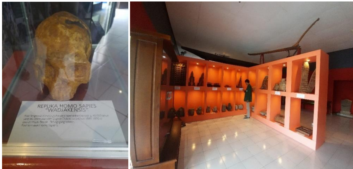
Figure 2. Replica of Homo Wajakensis and Collection Objects Tulungagung Regional Museum inside room

must position itself as a learning medium and learning resource that can help realize student competencies in the context of learning towards formal education carried out in schools. In general, the Tulungagung Regional Museum has a very useful and interesting collection of artifacts which can be used as a learning resource for the general public, students and teachers at the elementary (Elementary School), SMP (Junior High School) and SMA (Senior High School) levels, as well as the University.