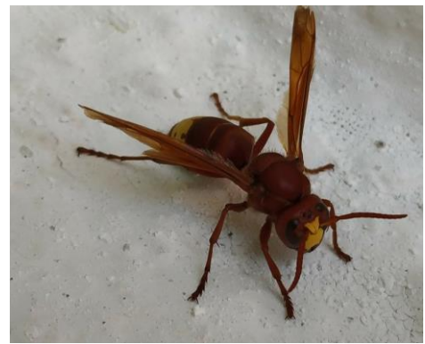
FIG. 2: Specimen of Vespa orientalis from Nisyros Island (photo by Giorgos Nikolakakis).

Nisyros: Emporios, 36.603213° N 27.177195° E (un. not recorded), 23.VIII.2019, 1 ex. (Fig. 3), photo by Giorgos Nikolakakis; near Stefanos Crater, 36.579618° N 27.167563° E (un. not recorded), 28.IX.2019, 1 ex., photo by Almut Martens.