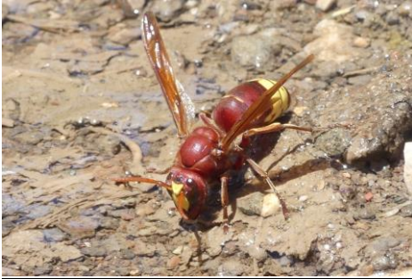
FIG. 1: Specimen of Vespa orientalis from Karpathos Island (photo by Benoît Segerer).

36.859731° N 27.34821° E (un. = 2 m), 7.VII.2020, 1 ex., photo by “mnauky”; near Chapel St John Perigialiti, 36.832264° N 27.06107° E (un. = 8 m), 23.IX.2019, 1 ex., photo by “manroth”; Kardámaina, 36.774457° N 27.133121° E (un. = 35 m), 16.VIII.2019, 1 ex., photo by “anlias”; Kefalos, 36.744239° N 26.967029° E (un. = 77 m), 1.V.2021, 1 ex., photo by “expatp”.