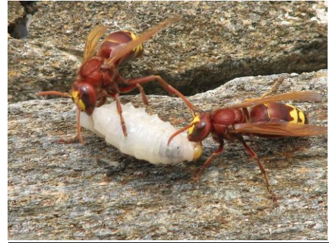
FIG. 3: Adults and larva of Vespa orientalis from Sifnos Island (photo by Kim Moore).

Sifnos: Exambela, 36.974124° N 24.731714° E (un. = 172 m), 22.X.2010, 2 adults and 1 larva (Fig. 1), photo by Kim Moore.