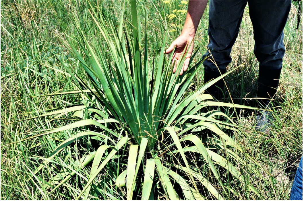
FIG. 4. Leaf rosette (Clary 432) [TEX-LL]. Chocolate Bayou, Brazoria National Wildlife Refuge.

Y. treculeana (iNaturalist obs. 24312828 and 221194239), near Mad Island WMA, Matagorda Co., the southern end of the range of Y. carrii .