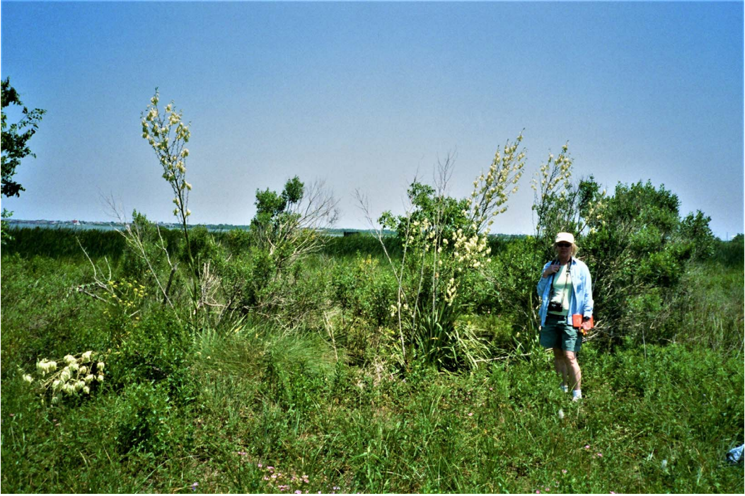
FIG. 2. Yucca carrii type locality. (Clary 427 [TEX-LL]). Texas Nature Conservancy (TNC) Texas City Prairie Preserve.

Galveston, scattered around San Leon on the north side of Dickinson Bayou (about 30 plants total), along the Texas City sea wall and the TNC Texas City Prairie Preserve (about 40 plants total; Fig. 2); Chambers, on the banks of Cotton Lake (about 10 plants); Brazoria, on the south side of Chocolate Bayou (about 50-100 plants), Brazoria National Wildlife Refuge (BNWR) (Fig. 3). Plants have been identified by photograph in Harris Co., the San Jacinto Battleground State Historic Site (Eric Keith), and Brazoria, Galveston and Matagorda counties (iNaturalist.org, https://www.inaturalist.org ). Limited surveys on existing roads have been undertaken to find more populations in similar habitat along the coast in Galveston (Galveston Bay, Galveston Island) and surrounding Chambers (Anahuac National Wildlife Refuge), Harris and Matagorda (San Bernard National Wildlife Refuge, Big Boggy National Wildlife Refuge) counties, but none have been found.