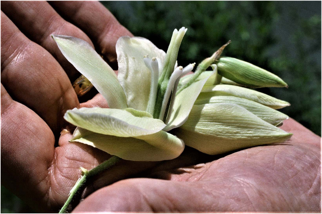
FIG. 5. Flower (Clary 418 [TEX-LL]). Dickinson Bayou and SH 146, Galveston Co.

pollination experiments has yielded fruit set (see Appendix, Pollination Experiments). Yucca moth larvae were translocated from Burnet and Lampasas counties to the BNWR population (2018) and in situ hand pollination efforts were made. Plants were translocated from BNWR to an area with live moth populations in Travis County, TX. No fruits have been produced to date.