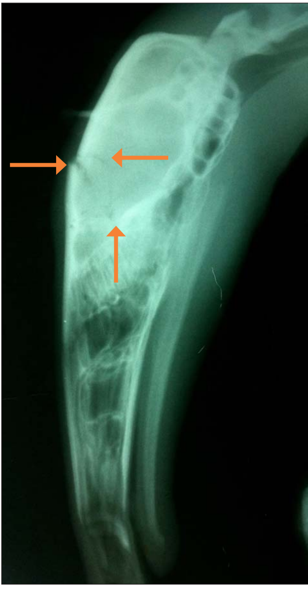
FIGURE 2. Radiograph with a laterolateral view on the tamandua's skull. A fracture of the frontal and parietal bone is visible (arrows).

obtunded. Warm water compresses were applied over the right eye for 10 min three times daily, and bandages were placed on all four paws over-night to prevent manipulation of the surgical wound. On day two meloxicam was not repeated due to dehydration and a concern for renal compromise. A 50 cm \times 70 \text{ cm} \times 55 \text{ cm} sized indoor enclosure provided the tamandua with soft bedding, warmth, and restricted movement. Thirty ml of a blend of mashed avocado, banana, puppy milk formula (Just Born Highly digestible Milk Replacer, Farnam Companies Inc., Phoenix, USA), coconut water, watermelon juice, papaya, and orange juice diluted in water were offered to the tamandua in a syringe every one to two hours. The rehabilitator massaged the tamandua's throat to encourage swallowing while feeding.