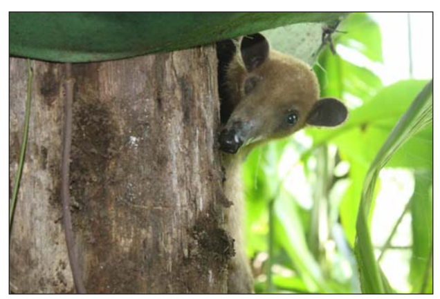
FIGURE 3. Fully recovered tamandua after approximately three months of rehabilitation, climbing one of the trees in the outside-enclosure in order to forage.

Following second surgery, the tamandua was given oral meloxicam (0.1 mg/kg) once daily for five days and 10 mg/kg amoxicillin (Andimox, 50 mg/ml; Laboratorios Andifar, Tegucigalpa, Honduras) orally once daily for ten days. The tamandua took all medications voluntarily with coconut-water. No redness or discharge was present at the surgical site. After the procedure the eye remained slightly swollen for 12 days.