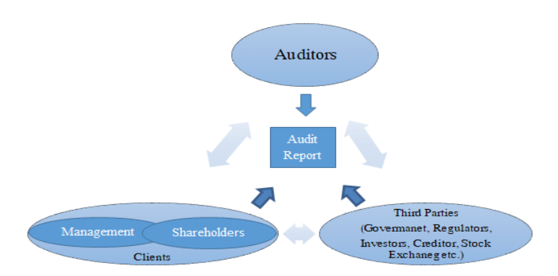
Figure no.1 Macro environment level